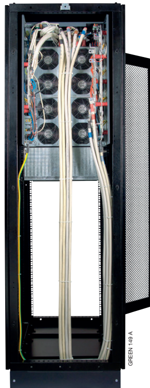
Rear view (before adding rear protective cover). Flexible cabling management for easy connections and tidier cabling.