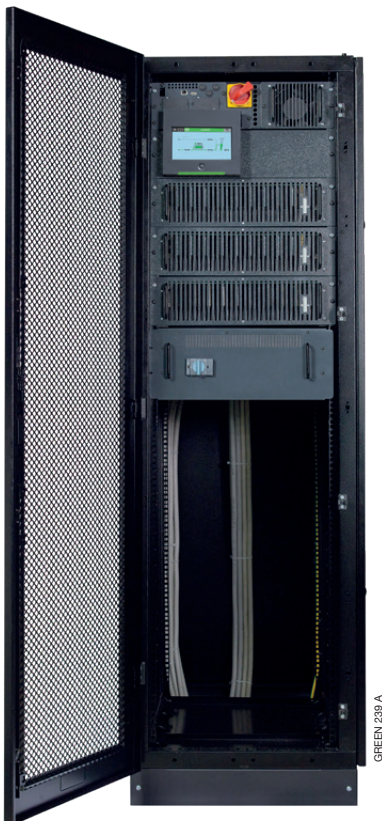
Example of integration (3x25 kW). Only 15 U of rack space occupied: space-saving design leaving free space for other rack-mounted devices. One empty slot in the MODULYS RM GP sub-rack remains available for power upgrade or redundancy.